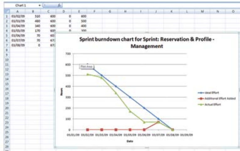
Figure 2 HP Quality Center and the Agile Accelerator to produce Sprint burndown charts to monitor progress real-time.

Customers wishing to move to Agile development can leverage the HP Quality Center Agile Accelerator—a complete solution that gives Agile teams, and in particular QA, the tools they need to deliver high-quality applications quickly and effectively: